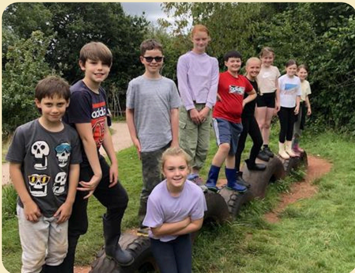
Kid's Activity Week at Occombe Farm 28 th July - 1 st August