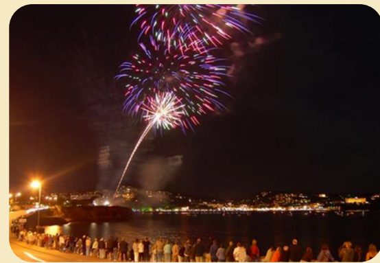
Paignton Festival Fireworks 31st July, 9.30pm