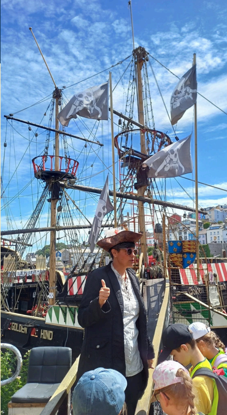
Year 4 pupils at Shiphay visited the Golden Hind in Brixham as part of their history theme, learning about Sir Francis Drake.