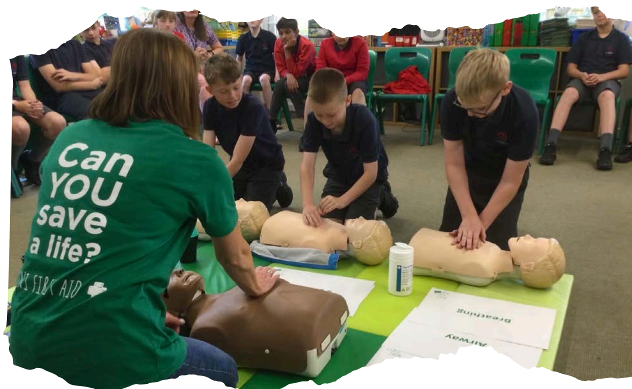
Year 6 children at Shiphay learnt essential first aid training, thanks to FOSS (Friends of Shiphay School)