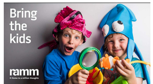
FREE admission to Royal Albert Memorial Museum, Exeter