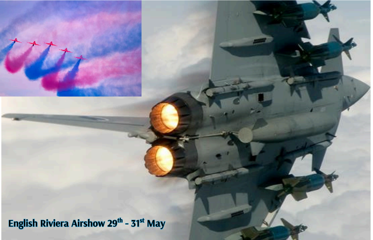
English Riviera Airshow 29 th - 31 st May