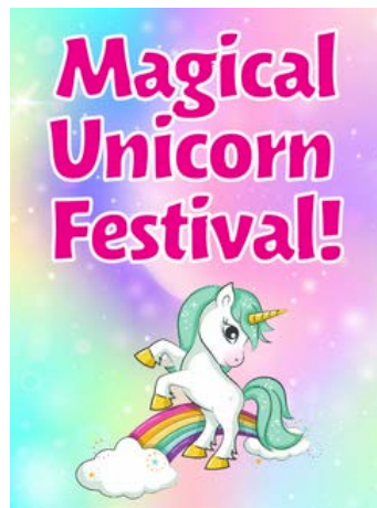
Pennywell Farm 16 th - 31 st May