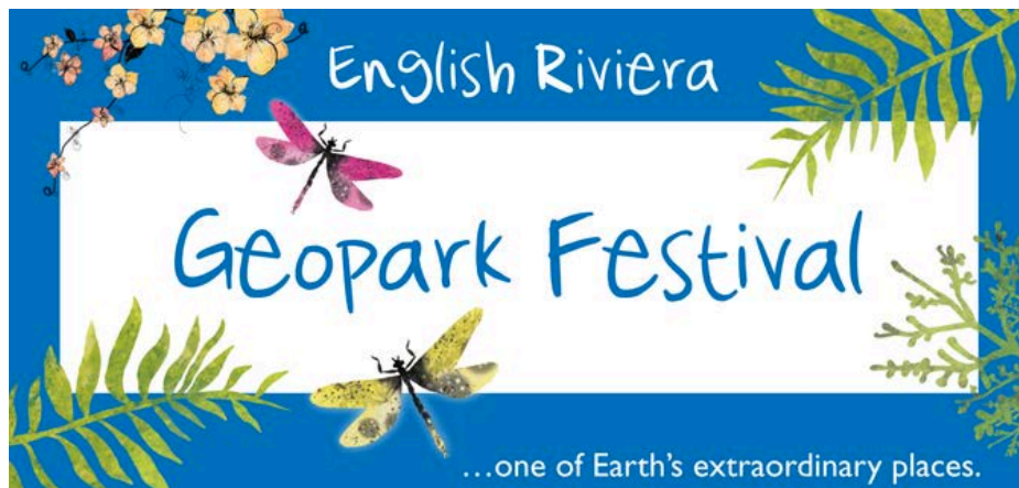
English Riviera UNESCO Global Geopark Festival 23 rd - 28 th May 2026