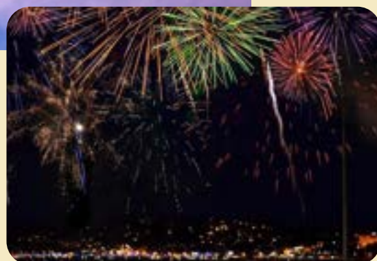
English Riviera Airshow Pyrotechnic Display (Paignton Green) and Fireworks at 10 pm, 30 th May