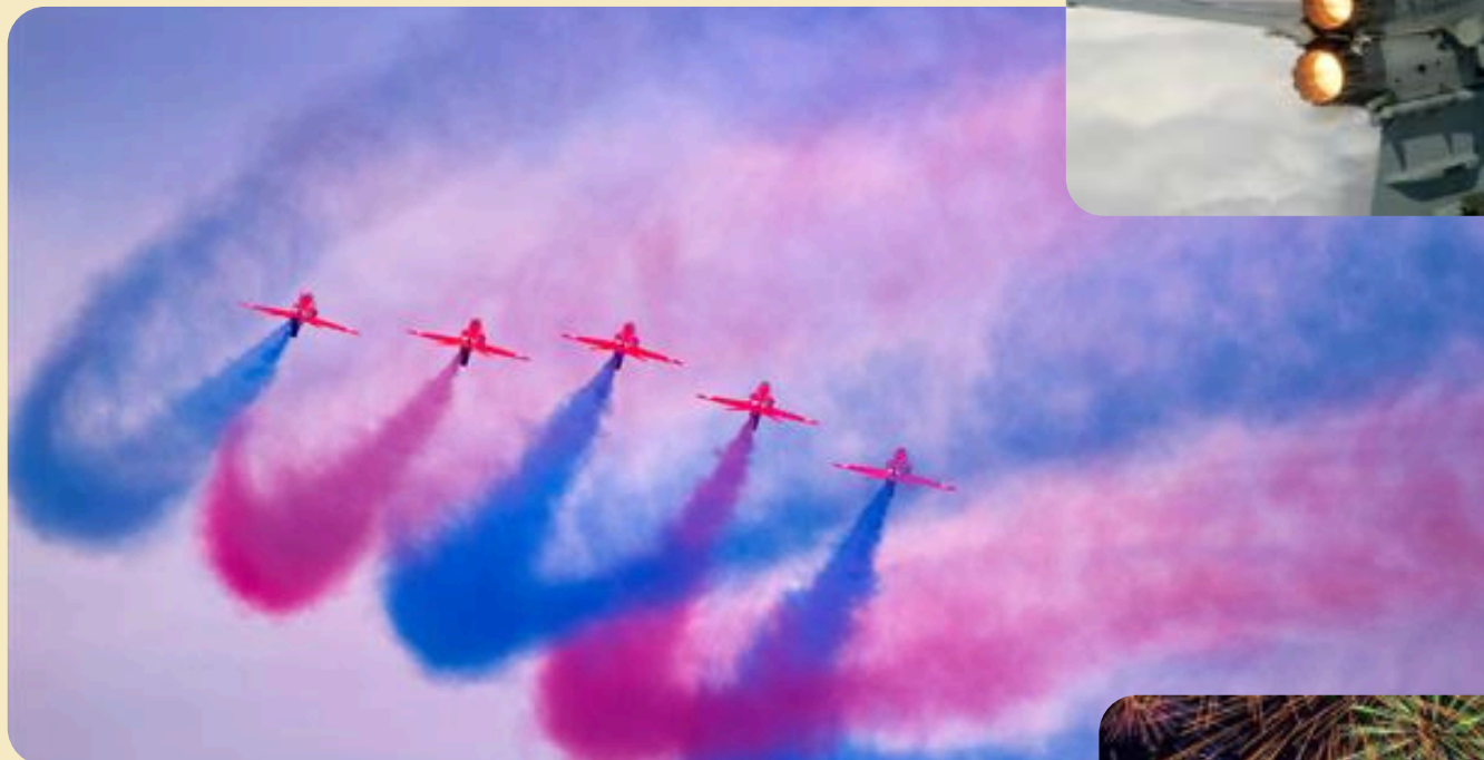
English Riviera Airshow - Friday 30 th May - Sunday 1 st June