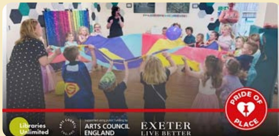
Phizz-whizzing performance, Paignton Library