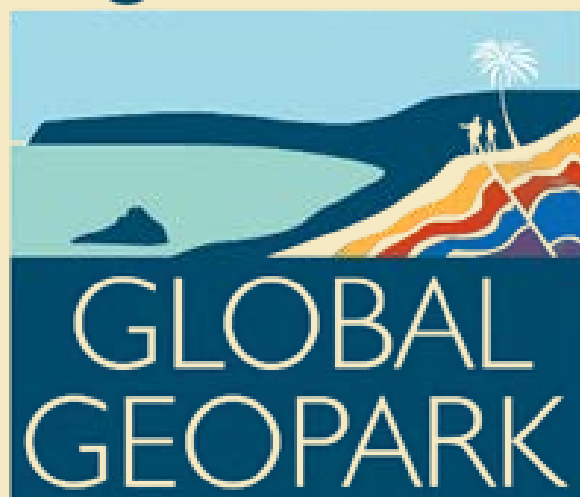
Geopark Festival 23 rd - 30 th May