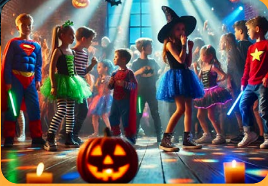
Kids' Halloween Discos at Ocombe Farm

Click on the images for more information