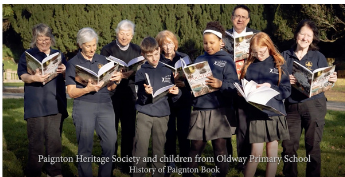
Paignton Heritage Society and children from Oldway Primary School History of Paignton Book

Roselands' Year 3/4 gardeners filled two boxes of freshly grown produce to give to Roselands Nursery to add to their food bank and one for the school kitchen so that everyone could enjoy some home-grown produce!